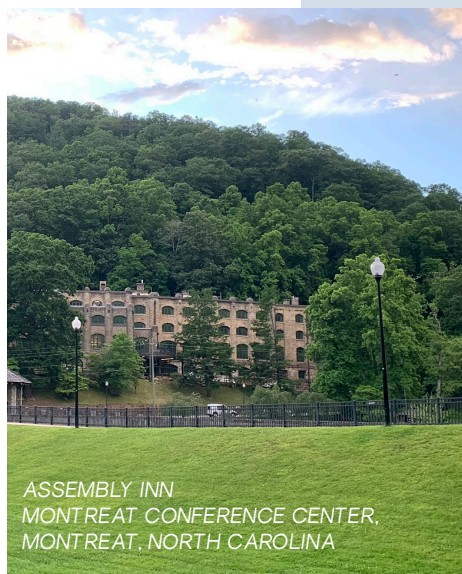
ASSEMBLY INN MONTREAT CONFERENCE CENTER, MONTREAT, NORTH CAROLINA